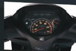
Quality Instrument Panel