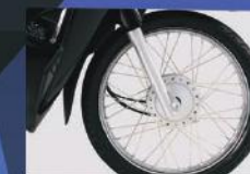
ECE Regulation No. 75 Compliant Tires and Spoke Wheel