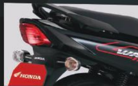
Highly Visible Clear Style Turn Signal Lamp