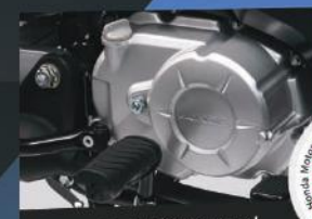
Fuel-Efficient and Environmental-Friendly 110cc Engine