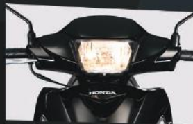
AHO-Equipped Headlight for Visibility