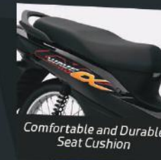
Comfortable and Durable Seat Cushion