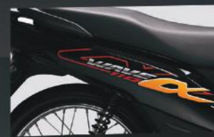
Striking Body Stickers