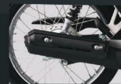
Stylish Muffler Cover