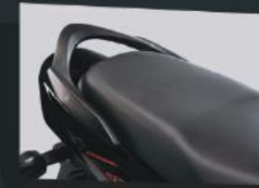
Sporty Rear Grab