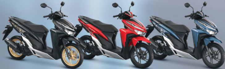
Matte Gunpowder Black Metallic